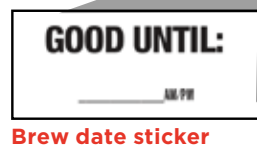
Brew date sticker