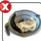
Never stack tea bags on top of each other.